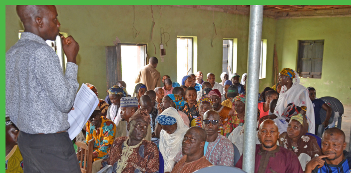
Carrying all citizens along in planning for the State is a novelty and an exciting experience. Ekiti and Osun States are leading this initiative in Southwest Nigeria.