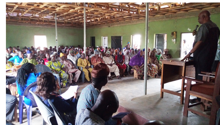
Through the Citizens' Needs Assessment exercise, communities in Ekiti and Osun States participate in planning and budgeting processes.