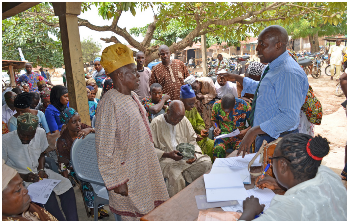
Community demands are already feeding into the budget in Ekiti State. Osun State is looking to implementing all of the recommendations that came out from the Citizens Needs Assessment Exercise.